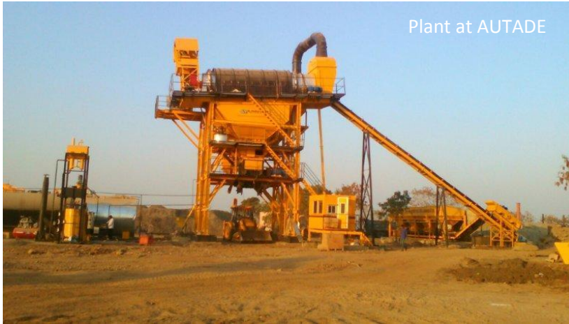
Plant at AUTADE